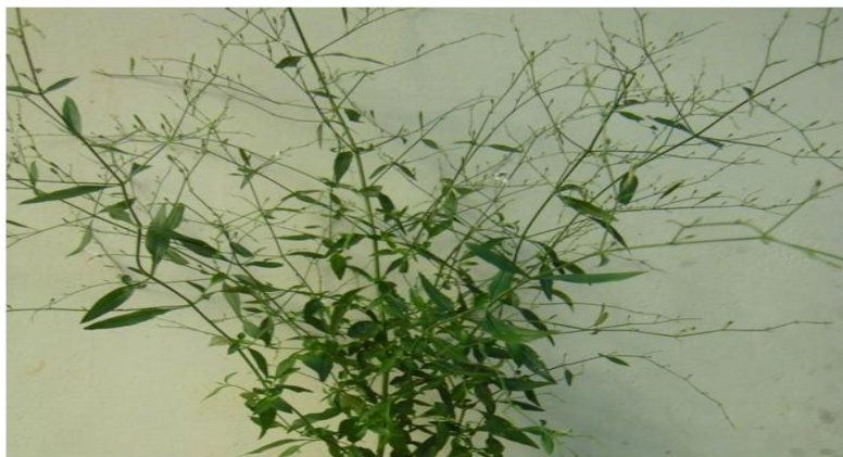
Fig 1: Aerial parts of Andrographis paniculata plant

Correspondence Aiyalu Rajasekaran KMCH College of Pharmacy Kovai Estate, Kalapatti Road, Coimbatore – 641048, Tamilnadu, India.