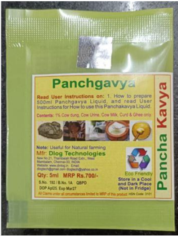
Panchgavya 5ml Pouch model April 25 MRP Rs.700